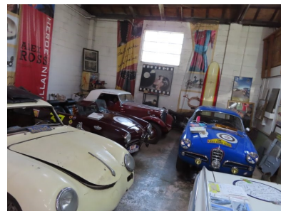
1956 Porsche 356 Coupe. Not restored yet.