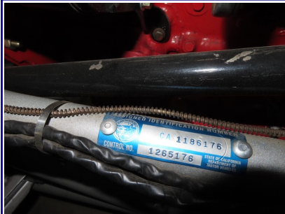
Blue Tag with new VIN...

Certified. If a car isn't registered for 10 years it is purged from the system. If you restore old cars you find, most likely they've been purged. The CHP has the Blue Tags that can have the new vin number and you can register the car. On the cars with computers, the vin number cannot be purged from that system. A great tool to fight crime.