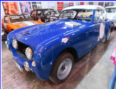
1954 Nash Healy Panin Farina

When you feel like driving one of the cars around town, which do you pick?