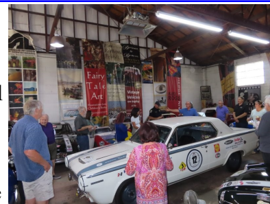
1964 Dodge Dart GT