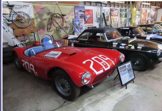
1955 MG Race Car #209.

it's worth twice that! He was crushed and went home. When his Dad got home that night he told his Dad. His Dad said OK, here's what you do. I'll loan you $250, you go back and offer $750, and say you'll rake leaves, mow the lawn and clean her gutters until the debt is paid off. He went back and told her,