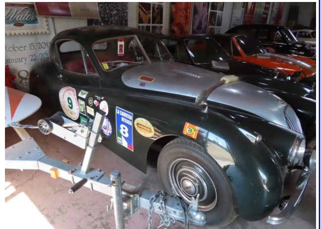
The Jaguar XK120 fixed head coupe, the oldest car in his collection.

The oldest car in his collection is the Jaguar XK120 fixed head coupe. What the Fixed Head Coupe refers to is that it's a hardtop, not a convertible or a roadster. Remember English parlance is different than American definitions of car parts are different. The front hood is called the bonnet. The roof is called the head and the trunk is called the boot. If you get a flat it's called a puncture. The Red 1955 MG Race Car has the number 209 on it. He figured it had something to do with the area code, but it didn't. He opened up the hood and started it up, and when it fired up, what a sweet warm low humm! Rough ride, no shocks, but sounds great!