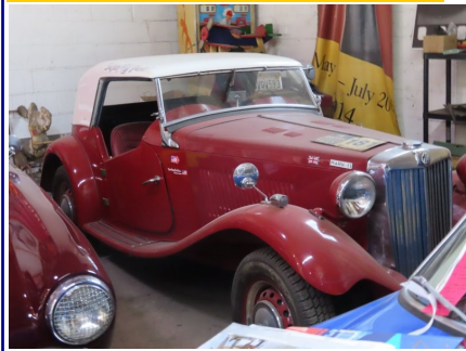
1953 MG TDE, Dick's first car and project.

Dick's first car of the collection was his neighbors at 1049 West Mariposa. The kids in the neighborhood used to get rides in that car. 1953 MG ended up on risers in their garage.